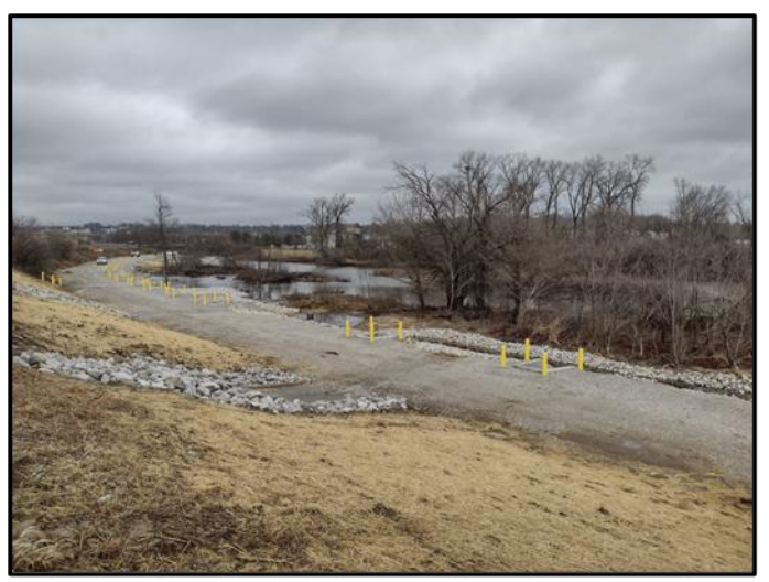
Figure 1: Reach 1 Construction Complete

Activities for FY24: Continue construction management for Reach 1 (physically complete, but contract not yet closed) and for Reach 2. Carryover funds are also being used to monitor the IRRM as necessary, provide OMRR&R payment to Wood River Levee and Drainage District for future O&M costs, to complete O&M manual development for sponsor turnover and Ribbon Cutting (not yet scheduled).